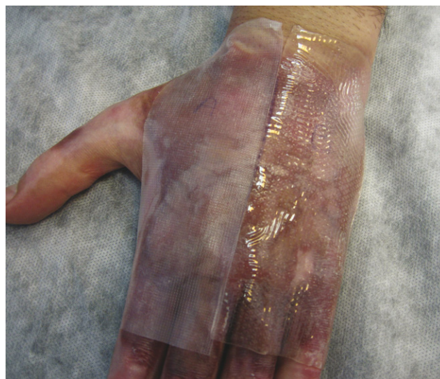
Fig. 2 – Application of silicone sheet and placebo.

Previous reports recommended using the silicone sheet for 12–24 h daily, which requires washing the scar and reapplying the silicone sheet. Side effects include pruritis, rash, maceration and foul smells; if side effects develop, therapy is immediately discontinued [6,7].