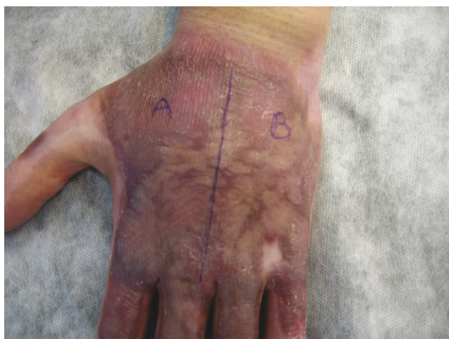
Fig. 1 – Burn scars randomly divided into two areas for treatment or placebo.

A random number table was used for the coding and randomisation of the gel and placebo samples. Silicone gels were applied to one segment of a single burn scar, such as the upper or lower part of the left forearm, and the other segment was covered with placebo (Figs. 1 and 2). Treatment was started 2–4 months after injury. Participants were followed up at 1 and 4 months after starting treatment. The gel and placebo sheets were removed for each examination, and each participant was sent to another plastic surgeon for the wound to be evaluated blindly. A digital camera recorded the serial changes in the wounds, taking front and profile views during each follow-up visit. An information protocol form was used to collect the participant's data and wound characteristics (pigmentation, vascularity, pliability, pain and itchiness) according to a modified version of the Vancouver scar scale, excluding height [5].